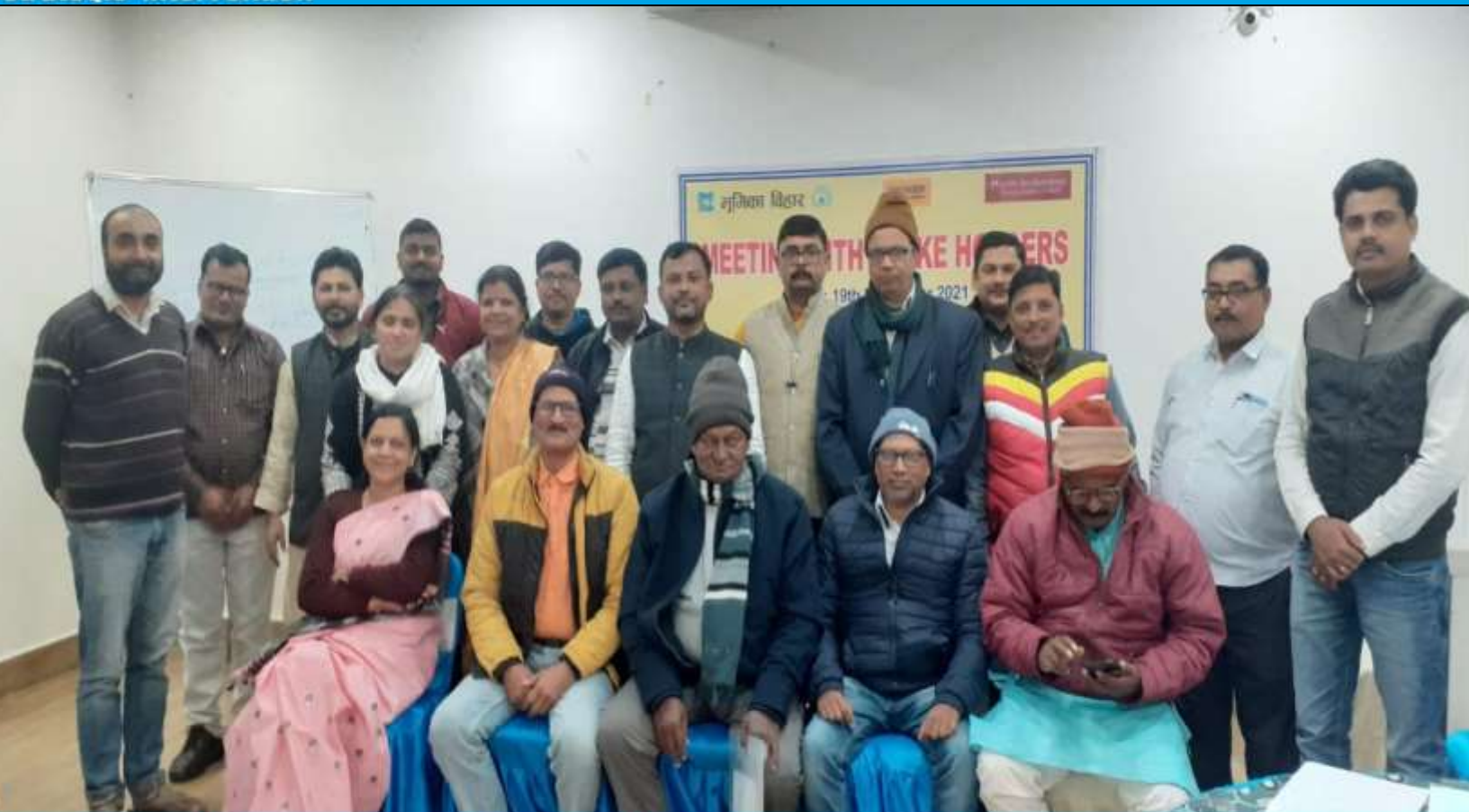
Strengthening of 'Campaign Against Child Trafficking' (CACT) to emerge as a large CBO advocating for stopping 'Fake Marriages and gender based violence' in Bihar State and Equipping the member with issue specific, thematic and technical competencies