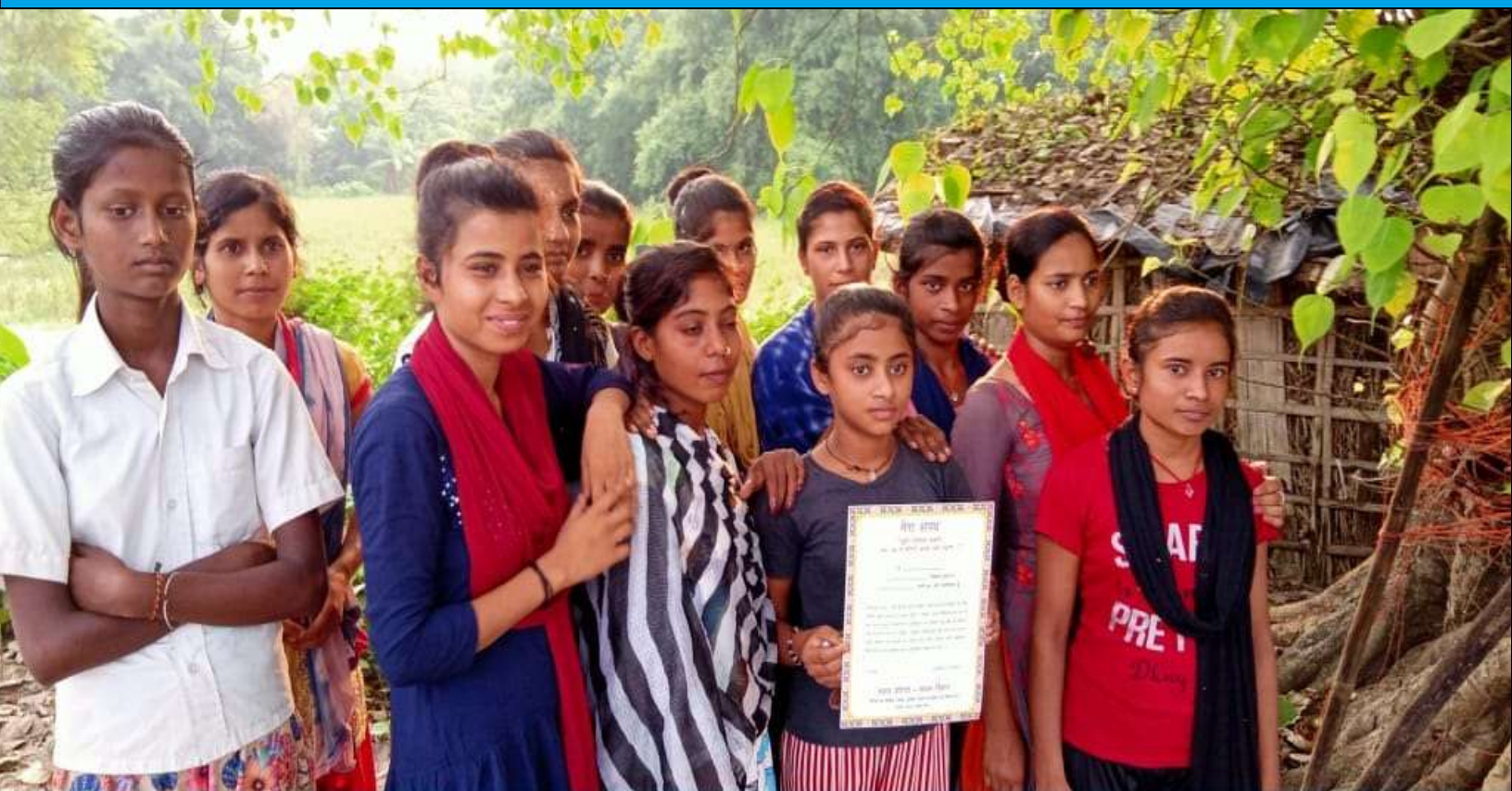
Advocacy Outreach Intervention initiating by The Balika Panchayat Girls