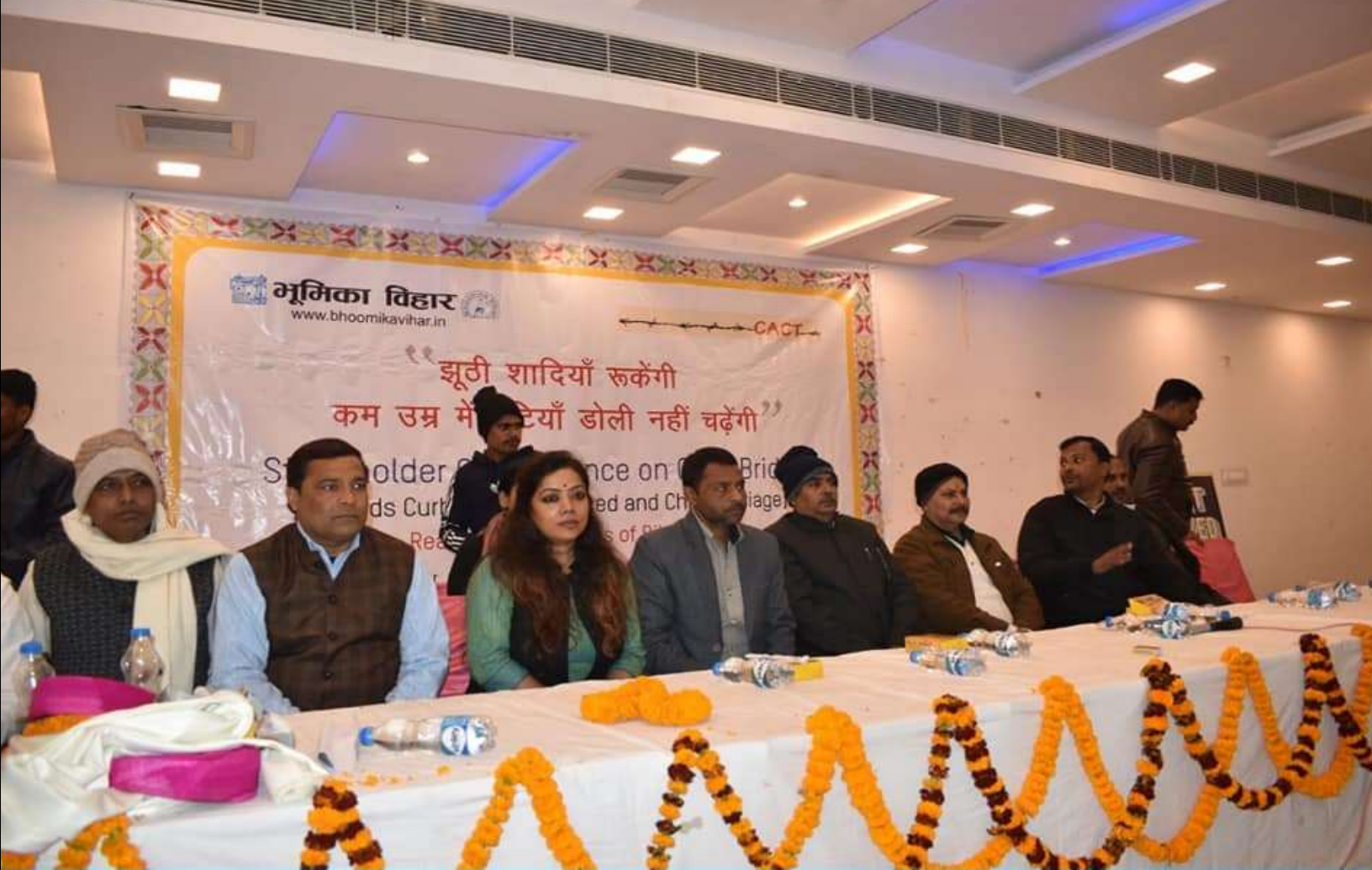
Stakeholder Convergence on Stopping Child Brides District Outreach Across the Bihar with CACT Partner organizations