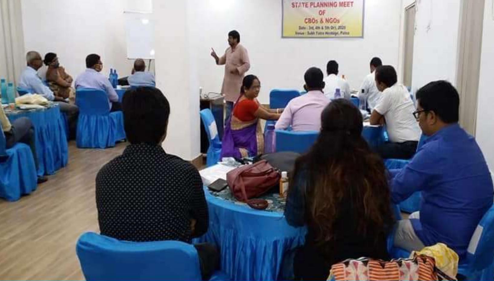
State planning Meet of CBOs and NGOs from 15 districts of Bihar and capacity building on strategic intervention